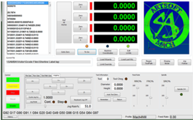
Mach4 Hobby: Multi-Line MDI Tab